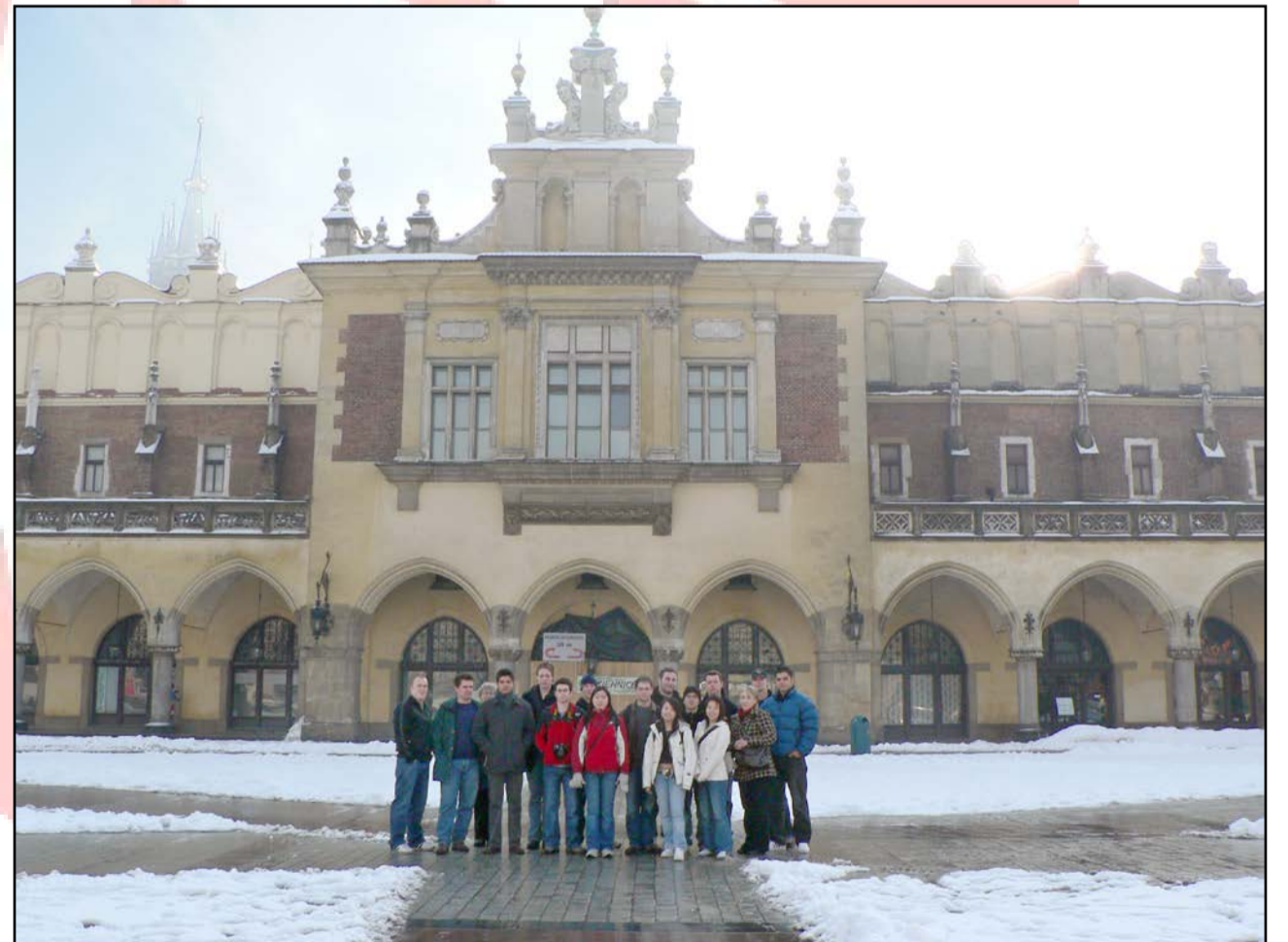
"Sukiennice" in the Main Square, Kraków, Poland