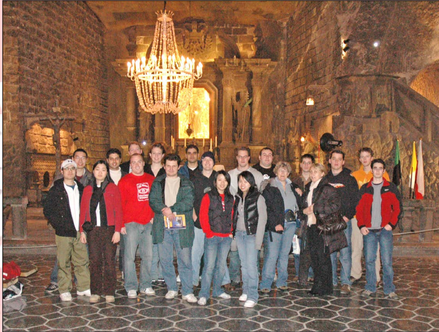
Underground in Wieliczka Salt Mine, Poland