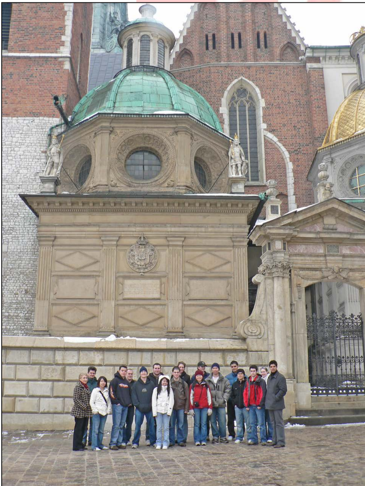
Wawel Castle, Kraków, Poland