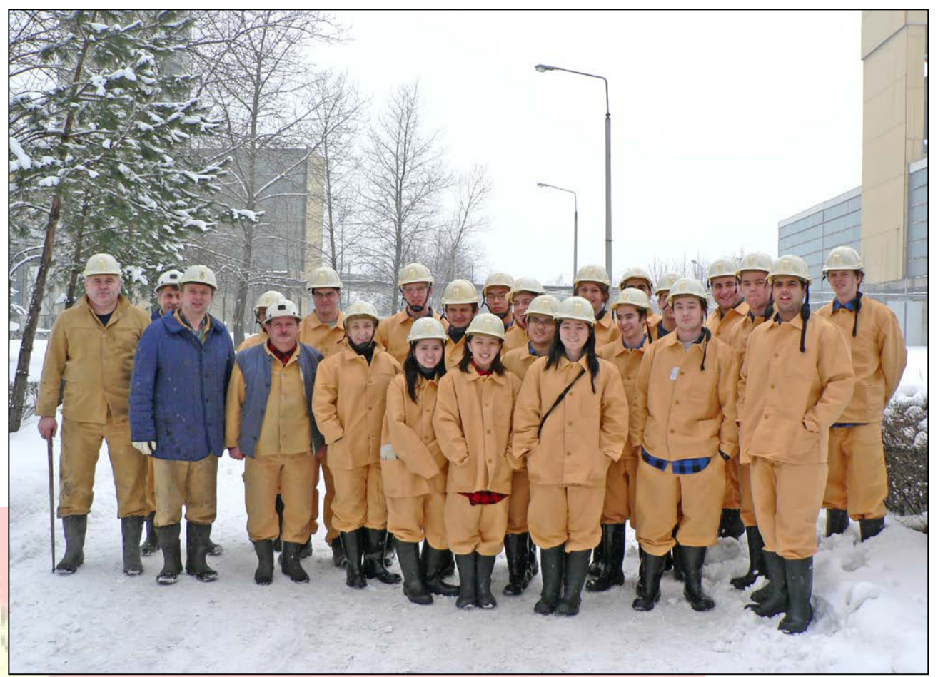
JSW "Krupiński" Coal Mine, Suszec, Poland