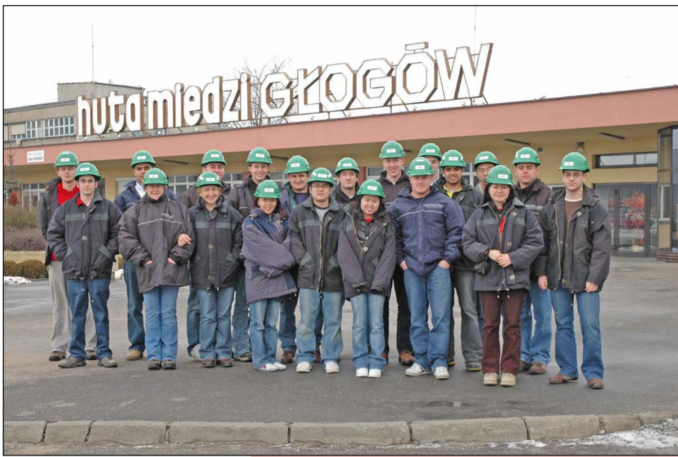
KGHM Copper Smelter in Głogów, Poland