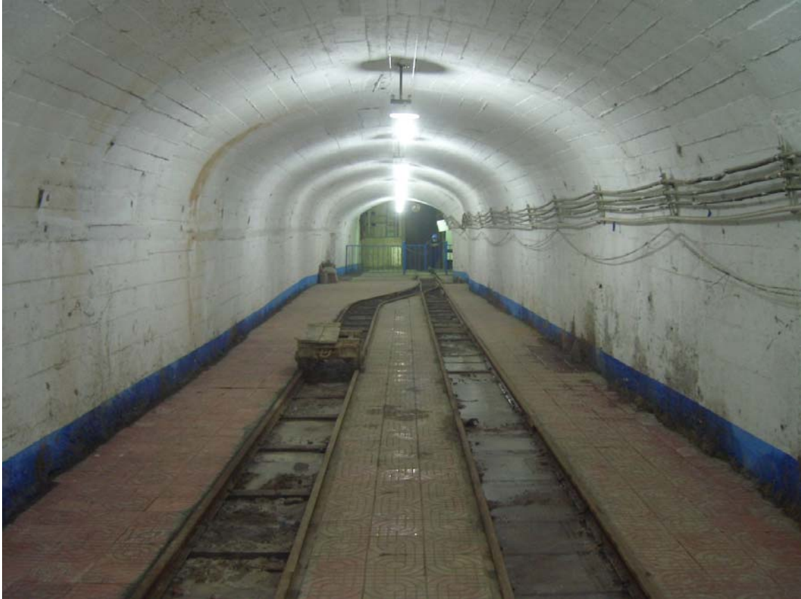
Figure 1 – Underground workings near shaft exit.