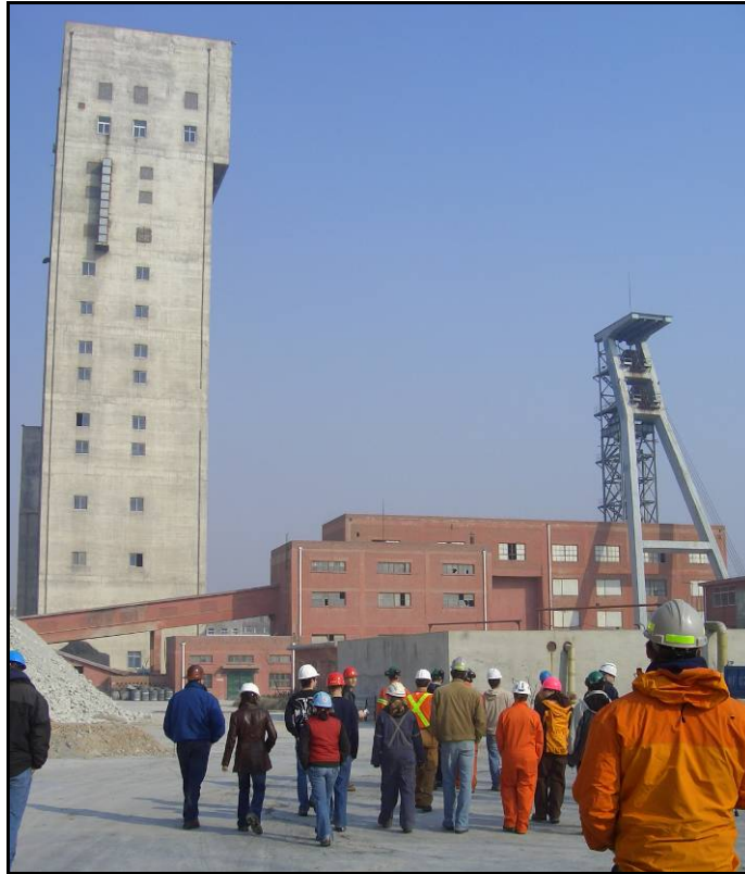
Figure 1 - Yingezhaug Headframe

The Yingezhaug Gold mine is classified as a low grade ore deposit with an average grade of 2.5g/t that is uniform throughout the ore body with a current reserve of 20 million tons. The only access to the underground workings is a single shaft that currently extends to 630m below surface. The head frame is 76m in height, and can be seen in Figure 1 below.