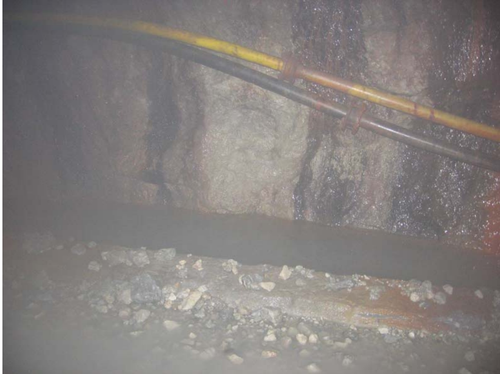
Figure 2-3 Seawater flowing into Sanshandao Mine

The Sanshandao Mine is a 3 800 tpd operation that produces both gold and silver through overhand cut-and-fill using 3 m drifts. The cut-off grade is 0.8 g/t for gold with an average grade of 2.5 g/t. Annually, the mine produces three tonnes of gold. The amount of silver produced was not disclosed. During our visit underground both the ore and the host rock appeared competent, requiring only 1.8 m split-set bolting at 1.5 by 1.5 m. The orebody was described to us as mild-hydrothermal altered as the mine is located in close proximity to the sea. As a consequence of the location, water is a major concern in the mine. It is required to eliminate 15 000 cubic meters of water daily, but this water is later put to use on the processing side. The mine is ventilated by two wing raises as well as the ramp in an exhausting system.