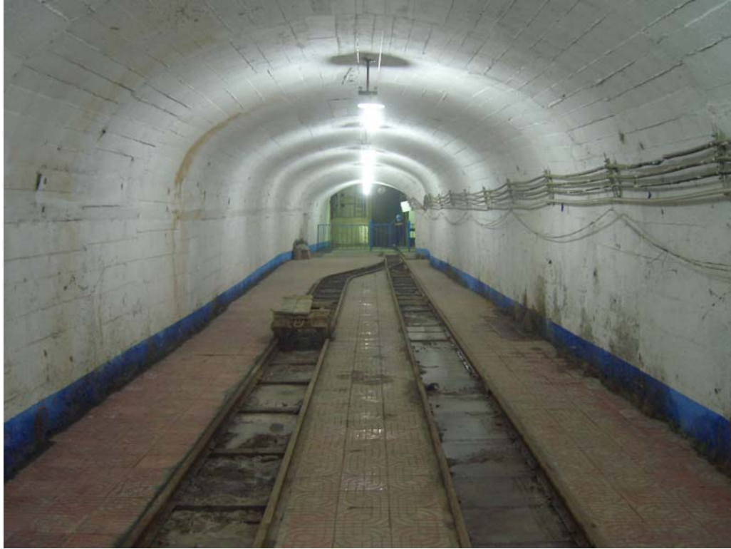
Figure 2-4 Main Haulage Drift at Jiaojia Mine

mechanized. Scoops are used to haul the ore from the drift to the ore bins. From the ore bins the rail cars are filled and the ore is transported to the shaft and then brought to the surface and sent to the mill for processing.