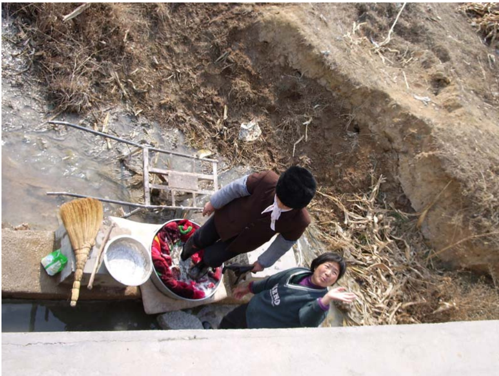
Figure 2-2 Women washing clothing at the base of the tailings dam

By law, no harmful contaminants can be released into the environment from the mine site. The current tailings pond that is in place has the capacity to satisfy the mine's needs for the next 20 years. As a result of the geographical location of the dam, drainage is able to be gravity fed back to the plant for use in processing. It is worth noting that 100 per cent of the water used in the process plant is recycled. The final plan for the impoundment is to turf and plant trees in sections. When we viewed the dam, it was noted that there appeared to be significant seepage into the surrounding farmland. The farmland continued to at least halfway up the side of the dam. People lived and farmed in harmony with the operation of the mine. When watching two women wash their clothes in a diversion ditch at the dam's base, it can be said that the mining industry in China really does integrate the community into its operation.