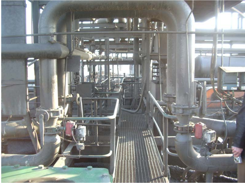
Figure 2-8 Standing above leech tanks at MIC BioGold