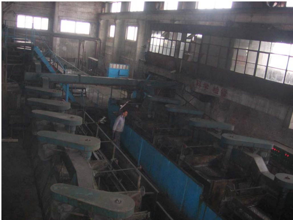
Figure 2-5 Flotation Circuit at Jiaojia Mine

This mine has its own cyanide leach plant with two separate leaching circuits. One of these circuits is for the ore from the mine itself, while the second circuit is for ore purchased from another mine that does not have leaching capabilities. This mine uses the Meryl-Crowe process after leaching to recover the gold sludge as concentrate. The concentrate is shipped off to a bio-ox plant or smelter. The overall grade of the final concentrate is 92 per cent