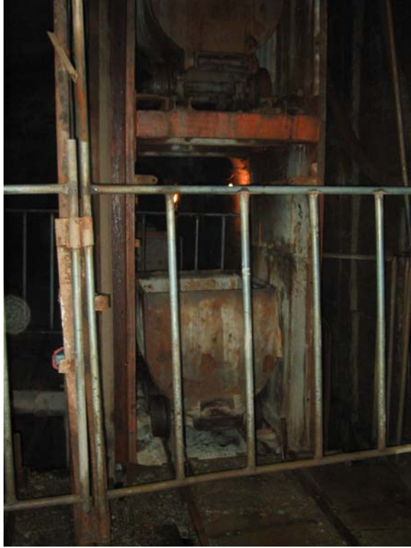
Figure 2-7 Skip at Tarzan Mine