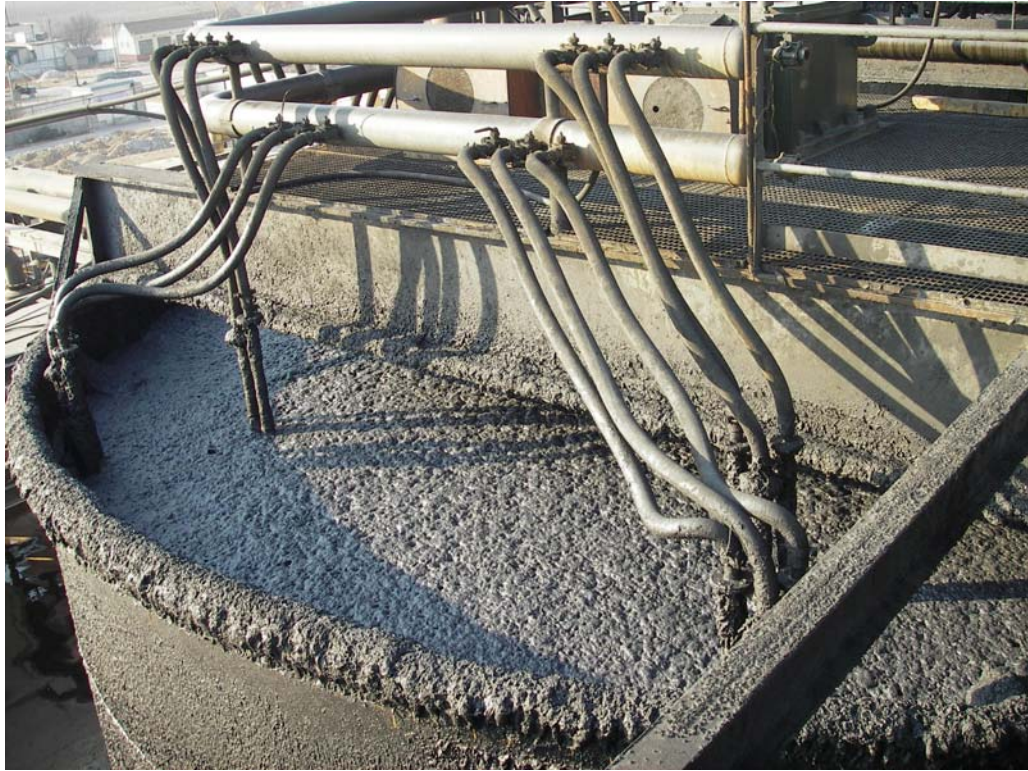
Figure 2-9 Leach Tank at MIC BioGold