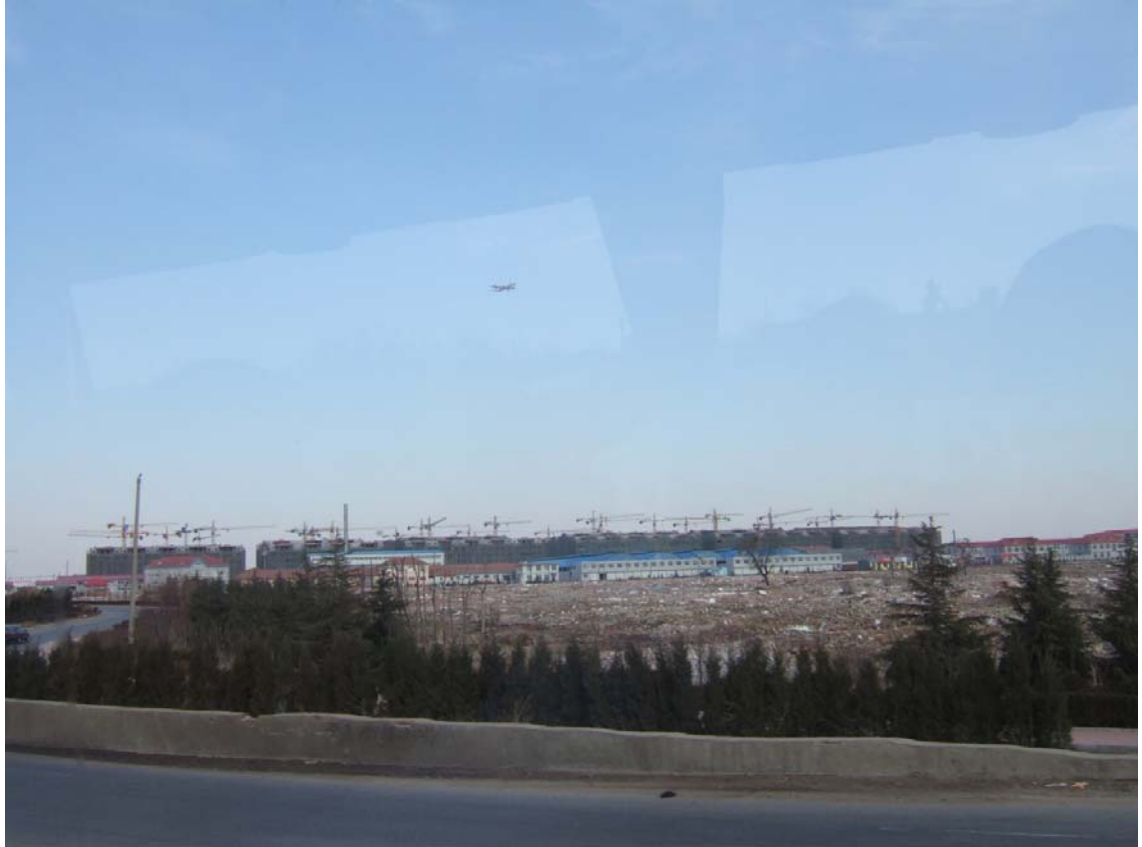
Figure 3-1: China's National Bird: The crane

The question remains: Can China sustain such rapid growth? It was hard to picture the need for fancy apartments and high rises when we saw people on the side of the road living a meagre existence. Davies also hinted that he felt China was a “bubble waiting to burst”. It seems that the Chinese seem to try to build as fast as possible without worrying about cost efficiency. This can be seen above in Figure 3-1, where at least twenty cranes are being used to build one apartment complex. In a country that is looking to compete with the rest of the developed world it is only a matter of time before this “blitzkrieg” style must be abandoned. Currently, the government is encouraging as much development as fast as possible, but sooner or later someone is going to have to pay the bill. When you look at the scepticism surrounding Vancouver, a wealthy western city’s ability to meet economic growth, you have to question how long China can sustain this development.